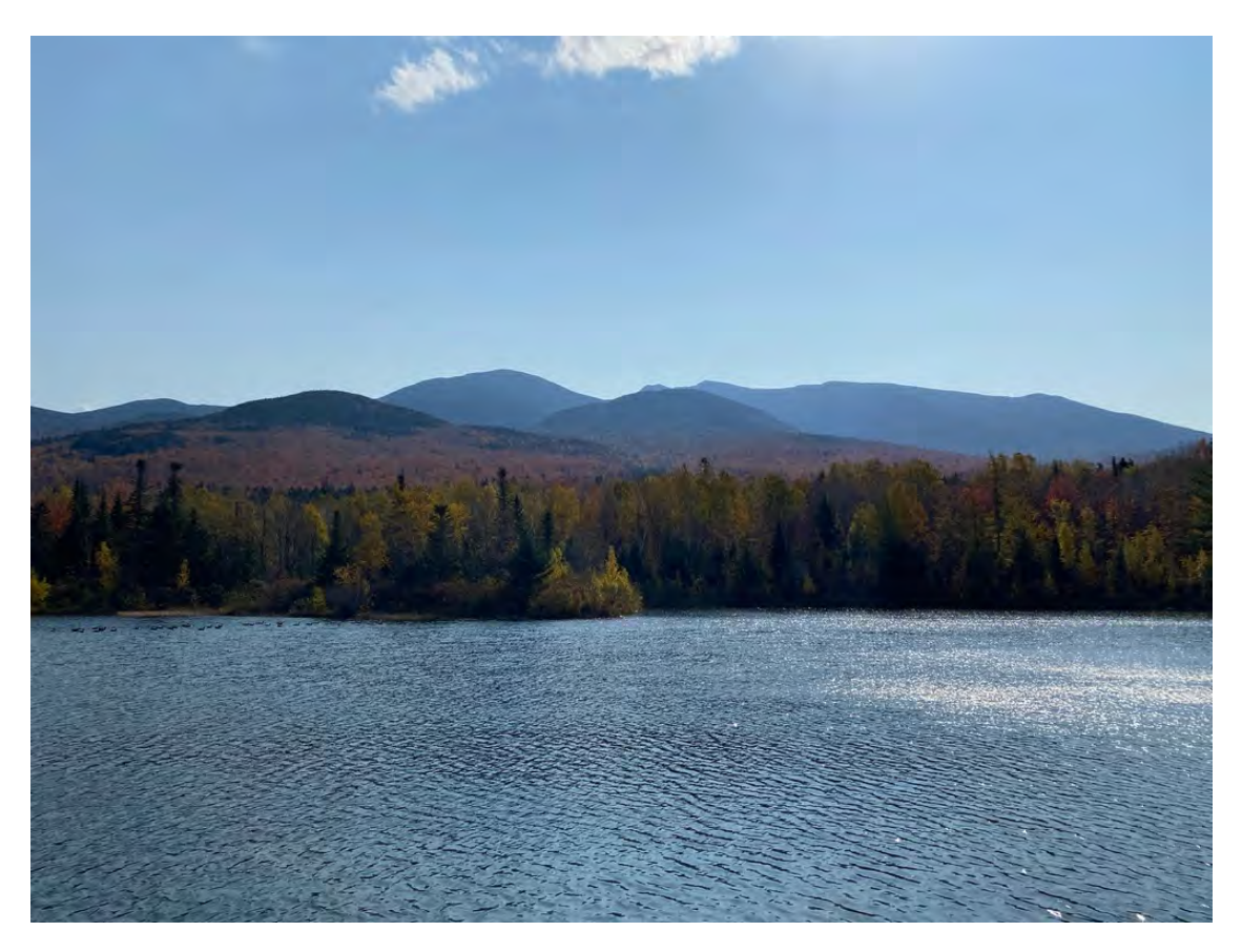
Madison and Adams from Durand Lake

The Foundation's website (randolphfoundationnh.org) and YouTube channel are updated to convey current information and materials.