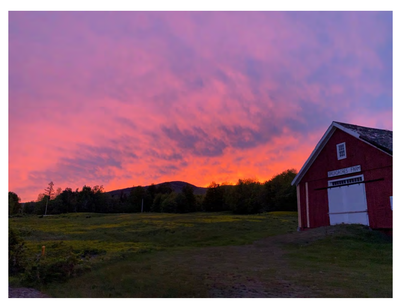
So much (unfiltered) beauty in our little slice of heaven!