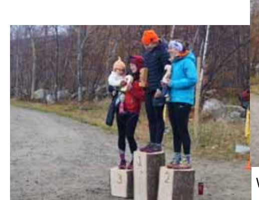
Winners all.