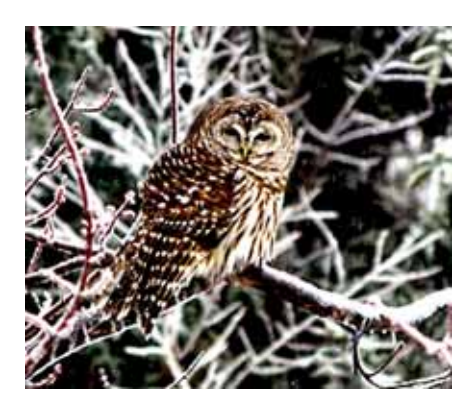
Karen Eitel Photography