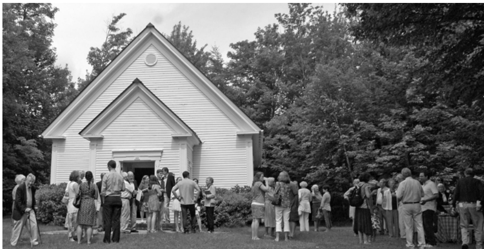
The Randolph Church started a new tradition this summer: punch and cookies were served on the front lawn following the 10:30 a.m. Sunday service. All were welcome including visitors from neighboring towns.