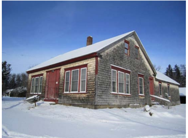
This house on the Farrar Farm is often referred to as the "oldest house in town."