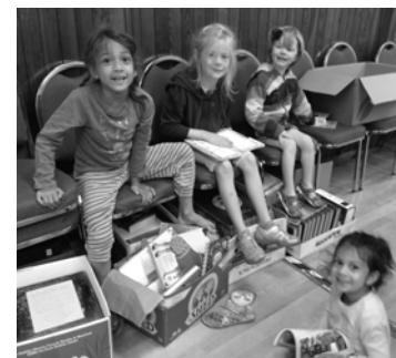
The Library Book Sale is a big hit with children.