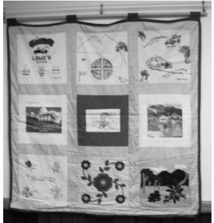
Smaller section of the Randolph Quilt.